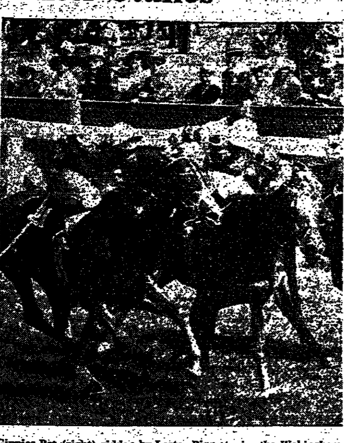
Gimmies Pet (right) ridden by Lester Piggott wins the Wokingham Stakes at Royal Ascot yesterday.